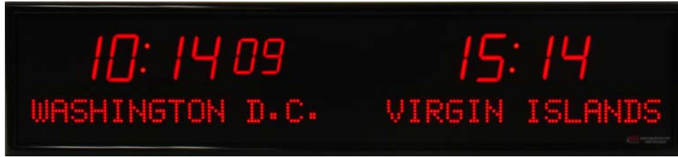
Model 7710G -2.5" time, 15 character 1.2" zone labels & date, 2 zones