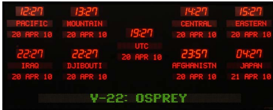
Model 7329A - 1.8" time, 1.2" zone labels & character date, 9 zone with a 48" tri color moving message display

The 7329 series time zone clocks have user changeable multi-color bar-segment LED time displays with a ten character user changeable multi-color dot matrix digital zone labels & dates below & a 7 color moving message display. The moving message display is either 2.0" or 4.0" single line display. The 7329 models display 9 time zones.