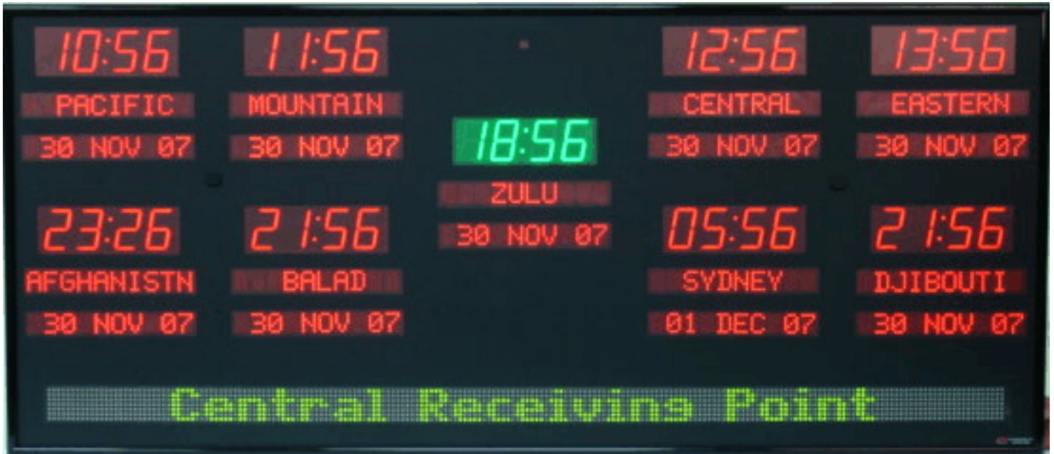
Model 7329B - 2.5" time, 1.2" zone labels & character date, 9 zone with a 60" tri color moving message display