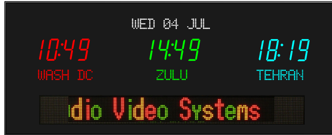
Model 6789L - 4.0" time, 2.0" zone labels, 2.0" 10 character date 4.0" dot matrix message display 48" wide, 3 zones