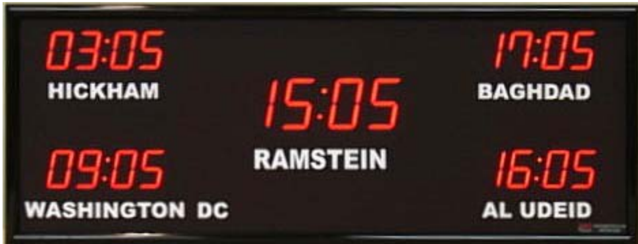
Model 664A - 1.8" & 2.5" time, 0.75" & 1.0" zone labels, 5 zones

The 664 series time zone clocks have user changeable multi-color bar-segment LED time with white vinyl zone labels below the time of each zone. 664 models display 5 time zones. Some models include a 10 or 20 character dot matrix LED date.