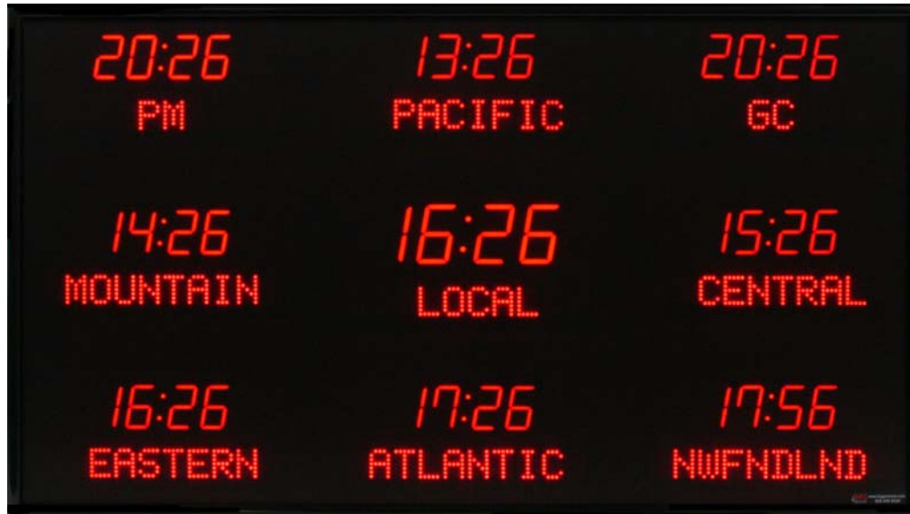
Model 6615A - 1.8" & 2.5" time, 10 character - 1.2" zone labels, 9 zones

The 6615 series time zone clocks have 9 user changeable multi-color bar-segment LED time displays with ten character user changeable multi-color dot matrix digital zone labels displayed. The 6615 models can display up to 18 time zones through page flipping. For example, the 6615A & B can show two pages of time zone information.