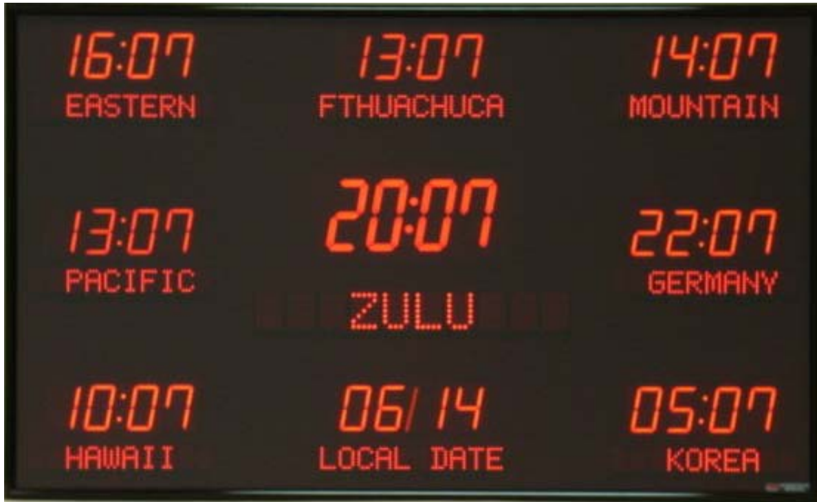
Model 6615B - 2.5" & 4.5" time, 10 character - 1.2" & 2.0" zone labels, 9 zones