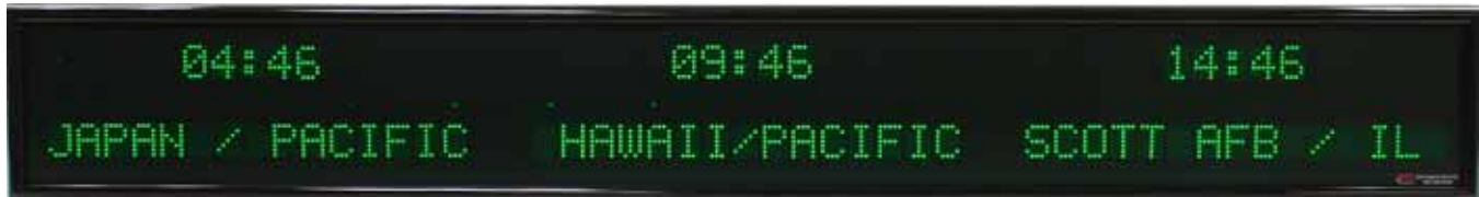
Model 5710CG - 1.2" time, 1.2" zone labels, 3 zone

The 5710 series time zone clocks have 5 character dot matrix LED time displays with a fifteen character dot matrix digital zone label below. In many 5710 models, the clock can display up to 12 time zones through page flipping. For Example, a three zone clock can show four pages of time zone information. Likewise, a five zone unit can show two pages.