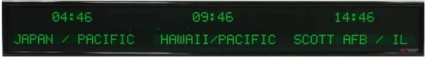
Model 5710CG - 1.2" time, 1.2" zone labels, 3 zone