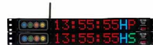
RC102 Redundant Primary Clocks