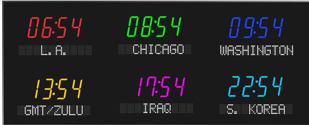
Model 6612M - 4.0" time, 2.0" zone labels, 4 zones