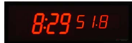
TGS840 Hours : Minutes : Seconds . Tenths