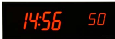
TGS840 4 digit time with julian date