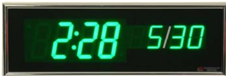
TGS840GRN 4 digit time with 4 digit date