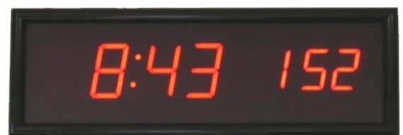
TG825 showing Hours:Minutes and Julian Date