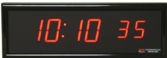
TG625 showing Hours:Minutes and Seconds

Up to 33 time and date formats are available to show what you need to see on the display. Formats include Hours, Minutes, Seconds, Tenths of Seconds, Hundredths of Seconds, Blinking Colons, Year, Month / Day (American or European), Julian Dates (3 versions), Blank, Decimal Minutes, Temperature (Requires optional temperature sensor), Leading Zero's, and of course 12 or 24 hour format.