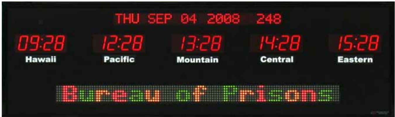
Model 689F - 1.8" time, 1.2" dot matrix date, 0.75" zone labels, 5 zone with a 48" Tri Color Message Display

The 689 series time zone clocks features a Dot Matrix LED date, bar-segment LED time displays with white vinyl zone label below & a tri color moving message display. A single line message display has a 2 inch variable font character. A double line message display can be configured as a double line 2 inch character or a single line 4 inch variable font character. In many 689 models, the clock can display up to 8 time zones at once. The date can be arranged in any format and can include Julian dates. For instance, you could have 14 APR 09 or FRI APR 14.