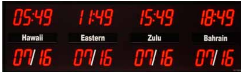
Model 663G - 1.8" time, 1.2" date, 0.75" zone labels, 3 zones