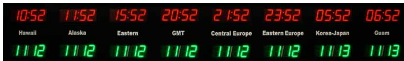
Model 663T - 2.5" time & date, 1.0" zone label, 8 zones with the G25W-R25W option