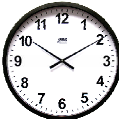
HP22P 22" Black Polycarbonate