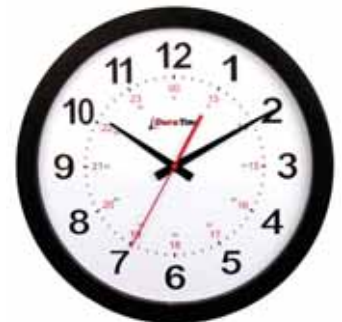
HP15P 15" Black Polycarbonate