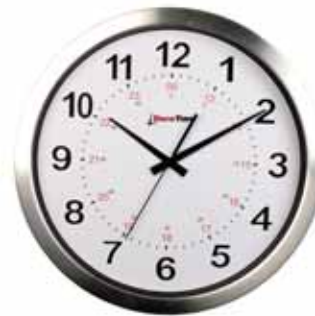
HP15A 15" Brushed Aluminum