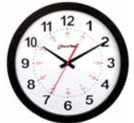
HP12P 12" Black Polycarbonate